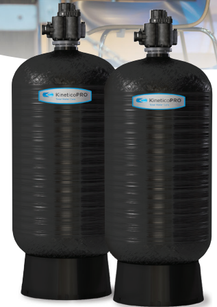
Hydrus Point-of-Entry Water Filtration Systems