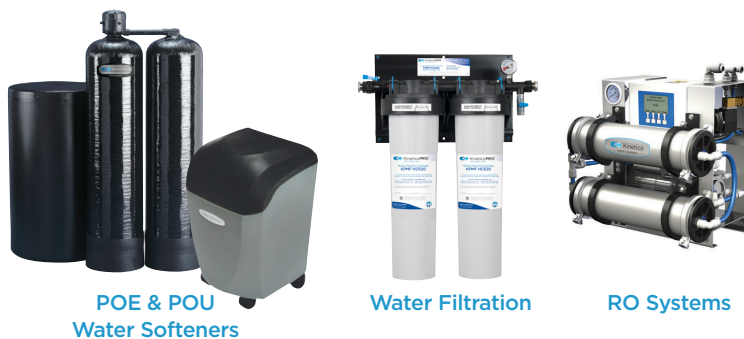
POE & POU Water Softeners

KineticoPRO® offers a complete range of commercial water treatment solutions. Based on a per-location water analysis, we will work with you to prescribe the ideal water filtration, softening, and reverse osmosis solutions to optimize your water quality and protect your equipment.